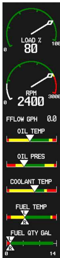
Default page, engine.

The engine instruments are displayed on the Garmin G1000 NXi MFD. Also refer to 7.13.3 - MULTI-FUNCTION DISPLAY (MFD) of this supplement.